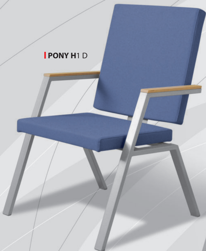
| PONY H1 D