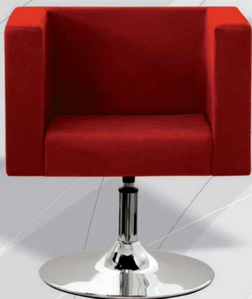
| KUBUS OT