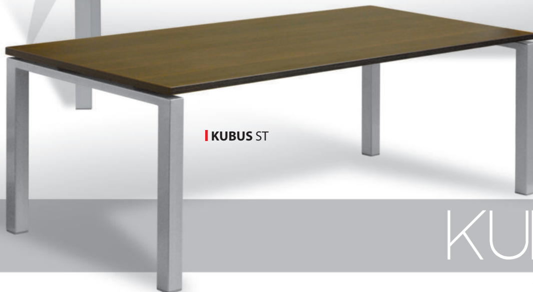
| KUBUS ST